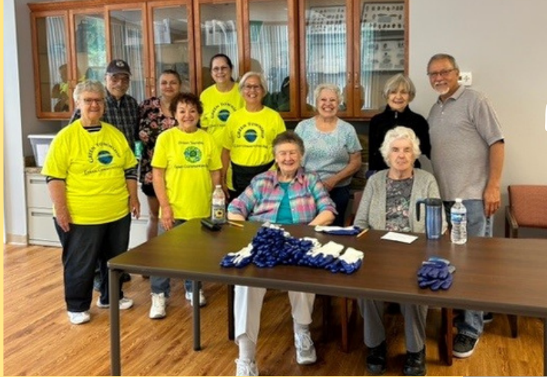
The Seniors helping with Clean Communities Day on May 13th

Meetings are held the 2nd and 4th Tuesday of each month at 1:00pm at the Municipal Building, 150 Kennedy Road. Interested in joining this fantastic group? Please call Fausto at 973-600-6002