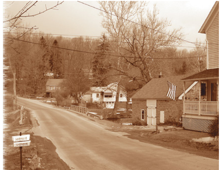
The Huntsville section of Green Township including the bridge over the Pequest River