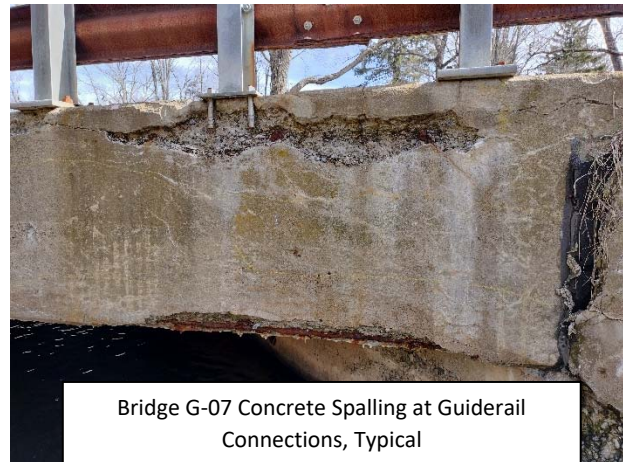
Bridge G-07 Concrete Spalling at Guiderail Connections, Typical