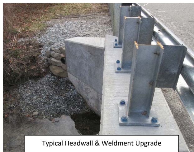
Typical Headwall & Weldment Upgrade