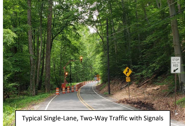
Typical Single-Lane, Two-Way Traffic with Signals