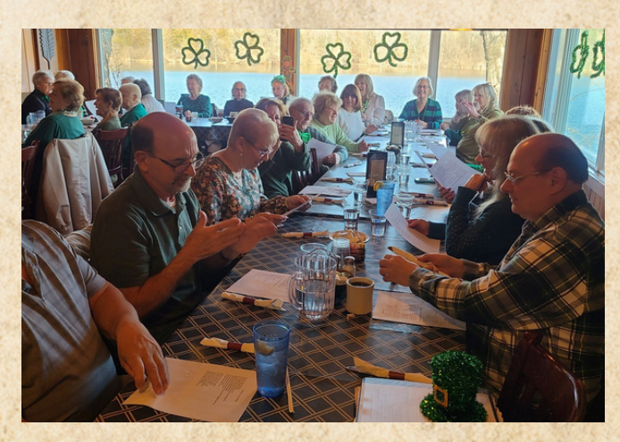
Seniors enjoy celebrating St. Patrick's Day at Sheridans in Andover