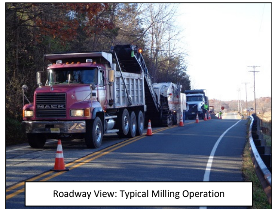
Roadway View: Typical Milling Operation