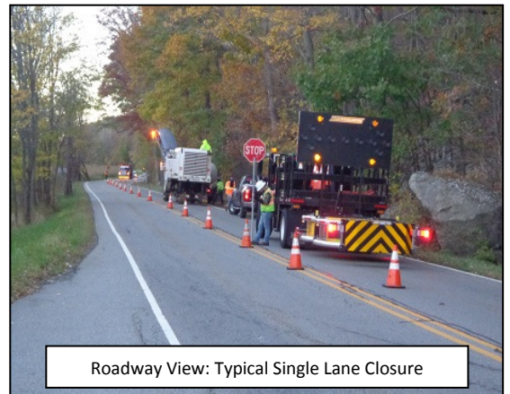
Roadway View: Typical Single Lane Closure