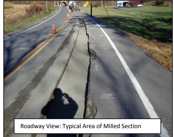
Roadway View: Typical Area of Milled Section